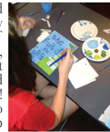
When the work was done, our new friends wanted to help our houseparents continue teaching about the Fruits of the Holy Spirit so they sat down with the girls in the activity room and did their own painting with a twist.

handed flyers to the shoppers asking if they would help Heart of Hope fill their food pantry. On July 28th, a truck and several cars pulled into Heart of Hope packed full of food, paper products, meat, meat, and more meat! Thank you First Baptist Minden and Sr. High Class for loving our girls and supporting us through your amazing donations! We also want to thank the shoppers who stopped to listen to these young people who asked you to help make a difference and help meet a need at Heart of Hope. Our shelves are stocked, our freezer is packed and our HEARTS are FULL! This is what you call a God idea! Love you gals and guys!!