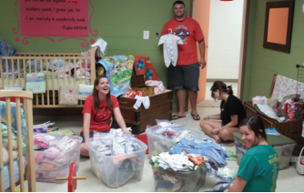
Having fun in The Hope Chest -- in our blog we will share about how significant this room has been in the young women's lives.

Woodridge Baptist • Grawood Baptist-Budget/Food Pantry • Providence Road Baptist The Healing Place @ Glad Tidings • Living Water Worship Center • Grand Cane Baptist Emmanuel Baptist –Budget/Food Pantry • Gateway Church • Trinity Heights Baptist Jewel SS Class- First Baptist Keithville • Adult III SS Class • Radiant Life Church Just for Ladies -- Radiant Life • Christian Center of Shreveport Cross Point Baptist • Calvary Baptist • Guardian Alarm Cypress Baptist • Eagle Creek Recovery Center • Church at Red River AccuTemp Cooling & Heating • National Mail-it • NW Louisiana Baptist Association Frozen Frog • Ark-La-Tex CPC • Genru Properties