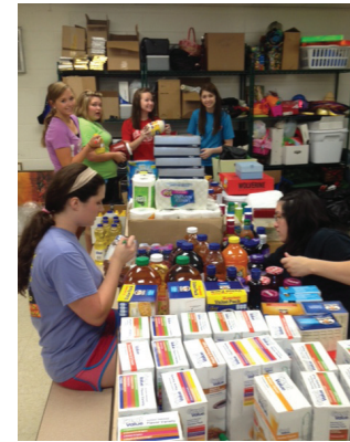
A few of the ladies from 1st Baptist Minden circling expiration dates on just one of four tables full of the donations.

"Just as the body is one and has many members, and all the members of the body, though many, are on body, so it is with Christ" (1 Corinthians 12:12)