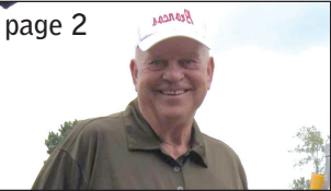
Loss of a Good Friend