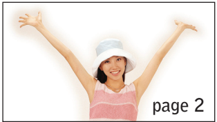
page 2 Fundraising Banquet

P.S. We want to give a Hearty shout out to National Mail It and Buckelew's Food Service Equipment Co. for your continued support!