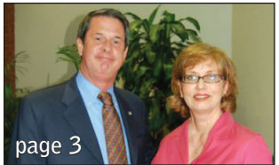
page 3 Heart of Hope's Own

P.O. Box 18776 Shreveport, LA 71138 318.925.4663