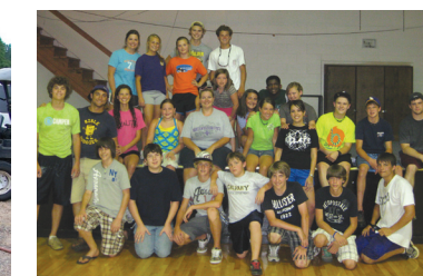
Summer Grove Baptist Youth

Thank you everyone at Redeemer for your unwavering commitment to save the unborn and seeing the needs of Heart of Hope!