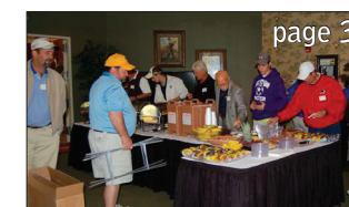
Son Shine & Sun Shine For Back In Swing