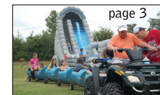
Second Annual Heart of Hope Carnival

P.O. Box 18776 Shreveport, LA 71138 318.925.4663