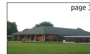
Building Renovation Update

P.O. Box 18776 Shreveport, LA 71138 318.925.4663