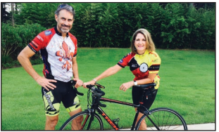
page 3 Let's Ride

10420 Heart of Hope Way Keithville, LA 71047 318.925.4663 www.heartofhopeministry.org