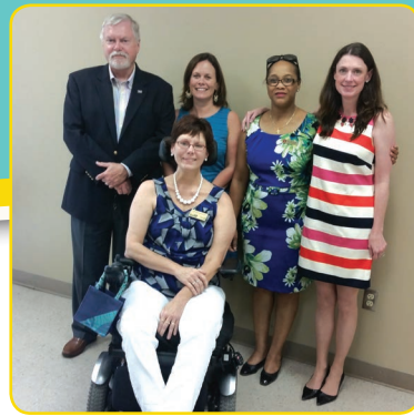
Members of Community Foundation of North La and United Way of NW LA

Even with our educational program's success, we believe we could enhance the classroom experience for our young women by strengthening our academics with hands-on learning in some courses. We researched how we could accomplish this and realized it would require several thousand dollars. At the end of 2014, we submitted a grant proposal locally in order to gain the funds needed for our onsite school.