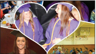
page 2 Graduation

Pictured on front page is our three newest babies born in June and July.